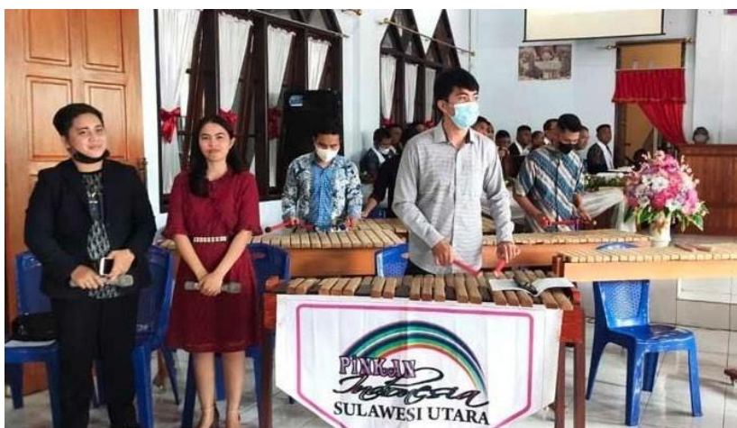
Figure 1. Kolintang being played during worship at the church

Additionally, kolintang serves as an effective tool for encouraging congregational involvement in the church's music ministry. Through regular training and group rehearsals, kolintang becomes a collaborative space across generations, reinforcing solidarity within the church community. For the players, kolintang also serves as a deeply personal form of faith expression—a way to offer prayers and praises to God through music.