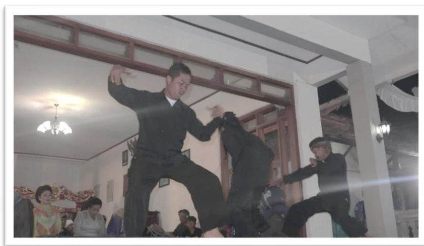
Figure 2 Pencak Silat (A traditional Indonesian martial art that combines self-defense techniques and artistic performance)

Implementing the Tarawangsa tradition is not only an expression of gratitude for the abundance of the harvest but also an acknowledgment of the natural resources and other blessings that Allah has bestowed. With various offerings that include symbols of diverse