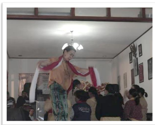
Figure 4 Paibuan

This tradition also involves the Saehu , a wise traditional leader with high physical and mental maturity, who conveys important messages while dancing. In addition, there are roles for Paibuan (figure 4) and Piramaan (Figure 5), who lead the groups of female and male dancers, respectively, and the Juru Kunci (Key Master), responsible for spiritual communication through incense burning.