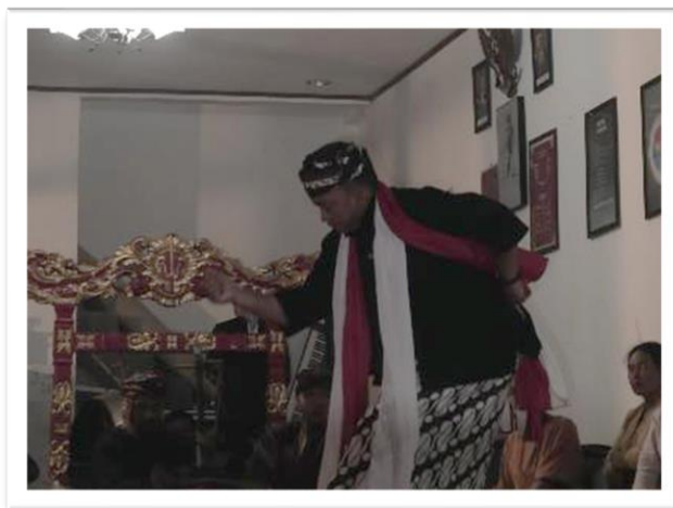
Figure 5 Paramaan

The Tarawangsa Art procession begins with an opening and communal prayer, followed by the Saeahu , who starts not with a speech but with the burning of incense and a silent prayer. Dancers then commence their performance, wafting the incense smoke towards their bodies as a symbol of inviting and honoring the spirits of their ancestors. The event continues until midnight, concluding with a performance by female dancers and followed by various other art presentations, reflecting the rich culture and traditions of the Rancakalong community passed down through generations.