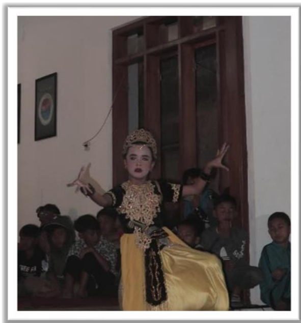
Figure 1 Jaipong Dance Performance (A vibrant traditional dance from West Java, Indonesia, known for its lively movements and rich musical accompaniment)