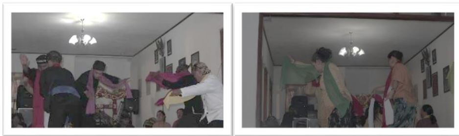
Figure 6 Colorful Scarves Worn by Tarawangsa Dancers

Uniquely, the Tarawangsa dance employs colorful scarves (figure 6) that carry deep meanings, representing various aspects of life and spirituality. The entirety of this practice, from the music to the dance and the scarves used, illustrates how Tarawangsa Art integrates physical and spiritual aspects, creating an experience that deepens awareness and understanding of human existence about the spiritual world.